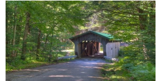
Morgan Covered Bridge, Belvedere, VT