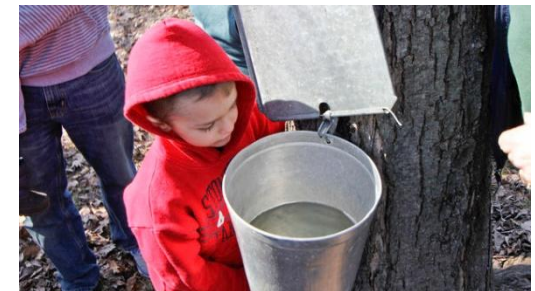
Harvesting maple sap for syrup

BURLINGTON, VERMONT RURAL CHAPLAINS ASSOCIATION